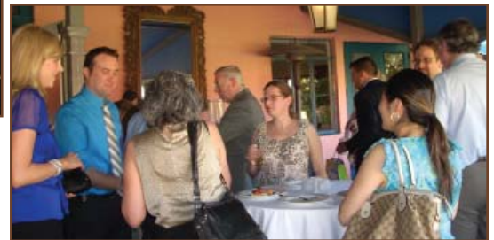
Faculty, houseofficers and students gather at the AZ Inn for the awards reception.

This time of year there are many good opportunities to show appreciation for the hard work of our students, houseofficers, and faculty educators. The Department of Medicine hosts an annual awards reception to give all of the sections the opportunity to recognize outstanding accomplishments. This year the reception was held on April 24th at the Arizona Inn. Many of the sections were represented and gave awards to people whose hard work deserved to be recognized. Some of the awards are selected by the faculty, others are voted on by the students. Below are some of the awards that were given out in our department this year.