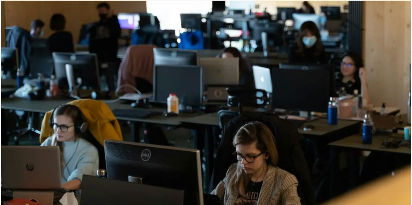
Open office landscapes often mean that the noise level is constantly high